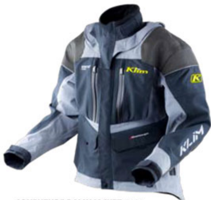
ADVENTURE RALLY JACKET 3191