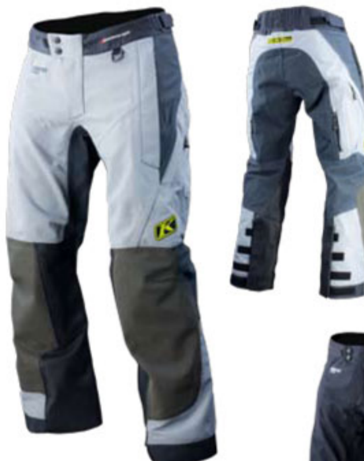
ADVENTURE RALLY PANT 3184